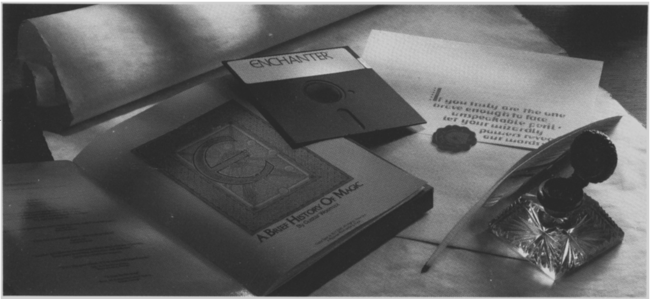
Sealed inside this ENCHANTER package are your ENCHANTER disk, Gustar Woomax's critically acclaimed Brief History of Magic and an ancient scroll containing such wisdom and guidance as we can provide.

In ENCHANTER, the first of a spellbinding series in the tradition of ZORK, ® you are a novice magician whom Fate has chosen to do singlehanded combat with a dark and fierce power. But worldly weapons will avail you naught, for your foe is the Evil Warlock who holds sway over the land.