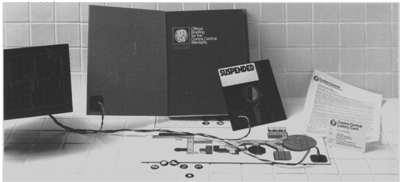
Inside every SUSPENDED package are these essential life-support mechanisms for cryogenically suspended persons: your SUSPENDED disk, schematic of the underground complex, robot tracking devices, pre-suspension briefing, lottery card and congratulatory letter.

They said you would sleep for half a millennium—not an unreasonable length of time, considering you'd be in limited cryogenic suspension. Your body would rest frozen at the planet's nerve center, an underground complex 20 miles beneath the surface. Your brain, they told you, would be wired to a network of computers; your mind would continue to operate at a minimal level, overseeing maintenance of surface-side equilibrium. And you would not awake, so they promised, until your 500 years had elapsed—barring, of course, the most dire emergency.