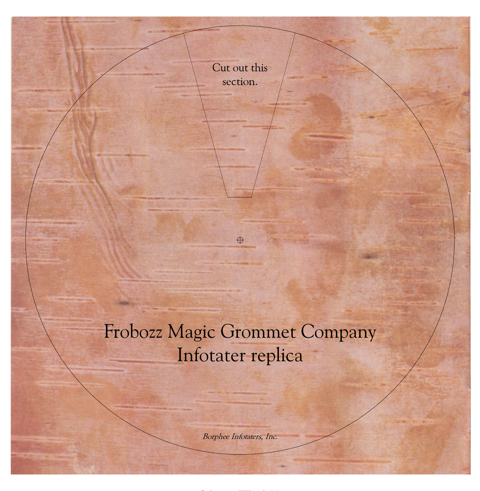
Selection Wheel #2