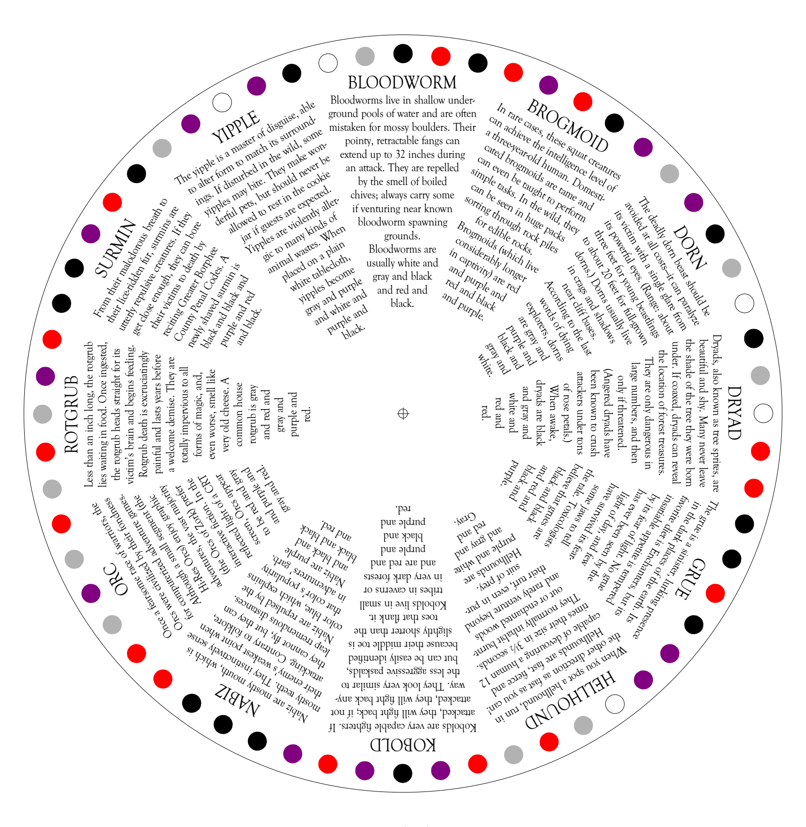
Data Wheel #1